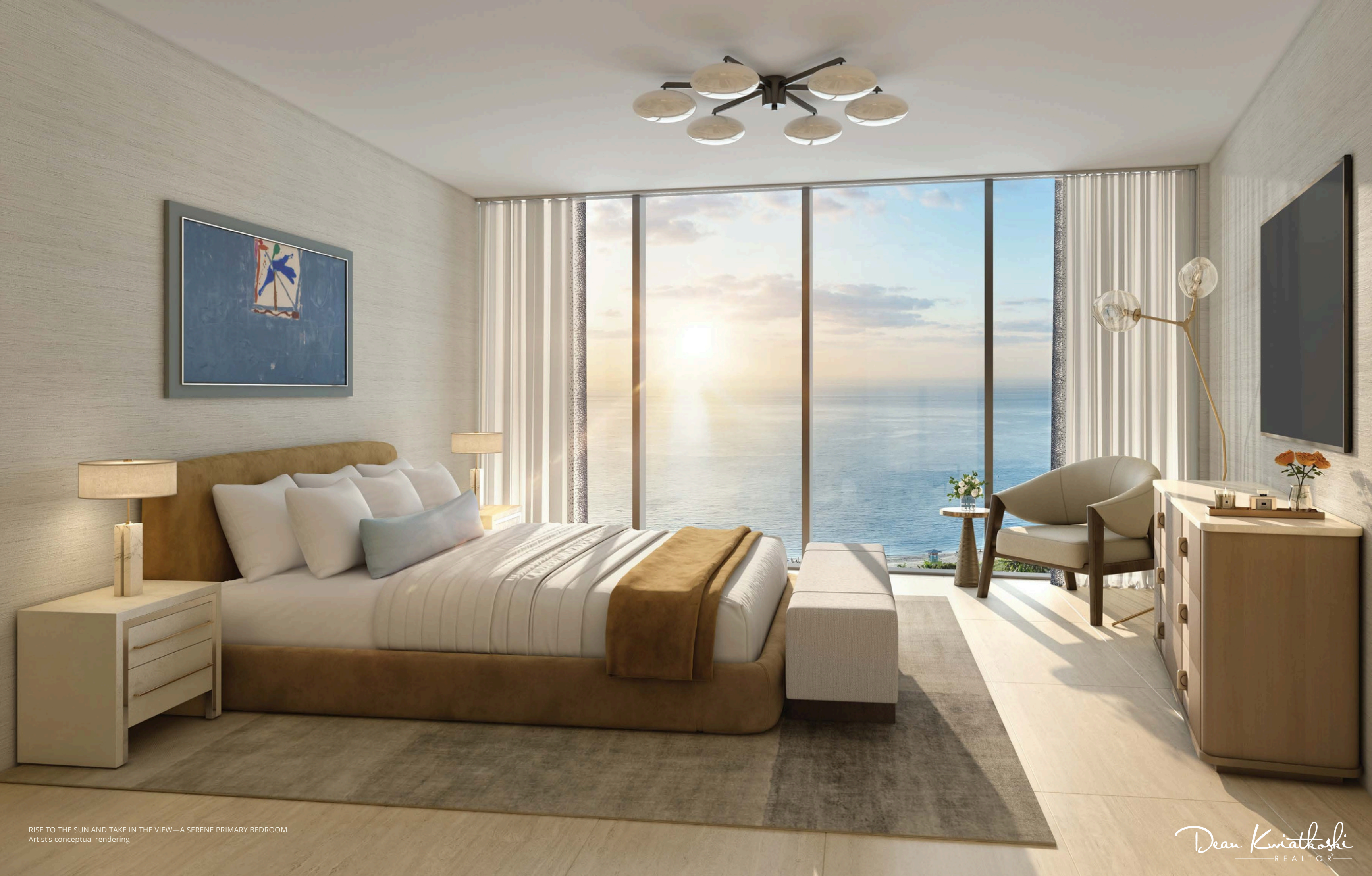
RISE TO THE SUN AND TAKE IN THE VIEW—A SERENE PRIMARY BEDROOM Artist's conceptual rendering