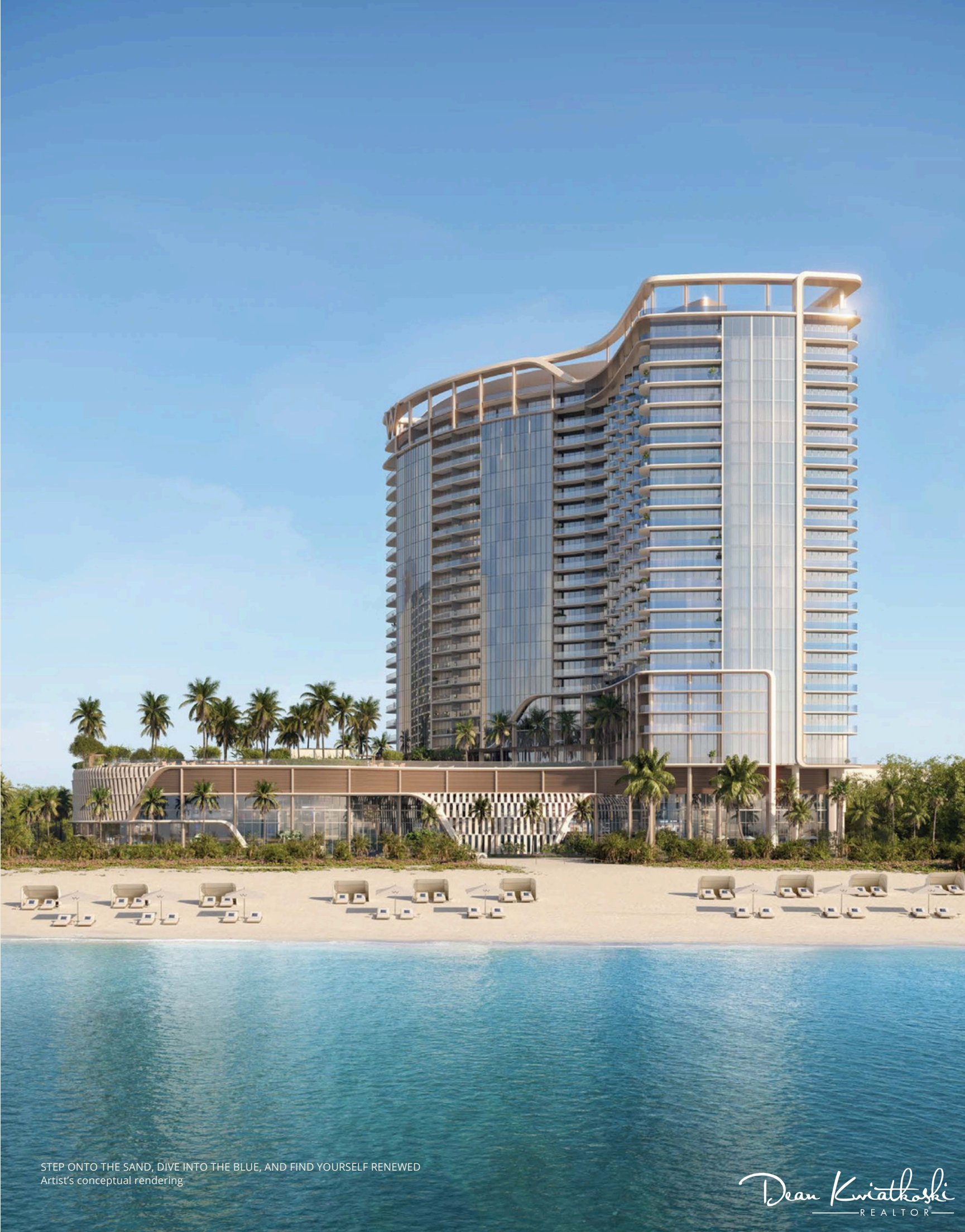
STEP ONTO THE SAND, DIVE INTO THE BLUE, AND FIND YOURSELF RENEWED Artist's conceptual rendering