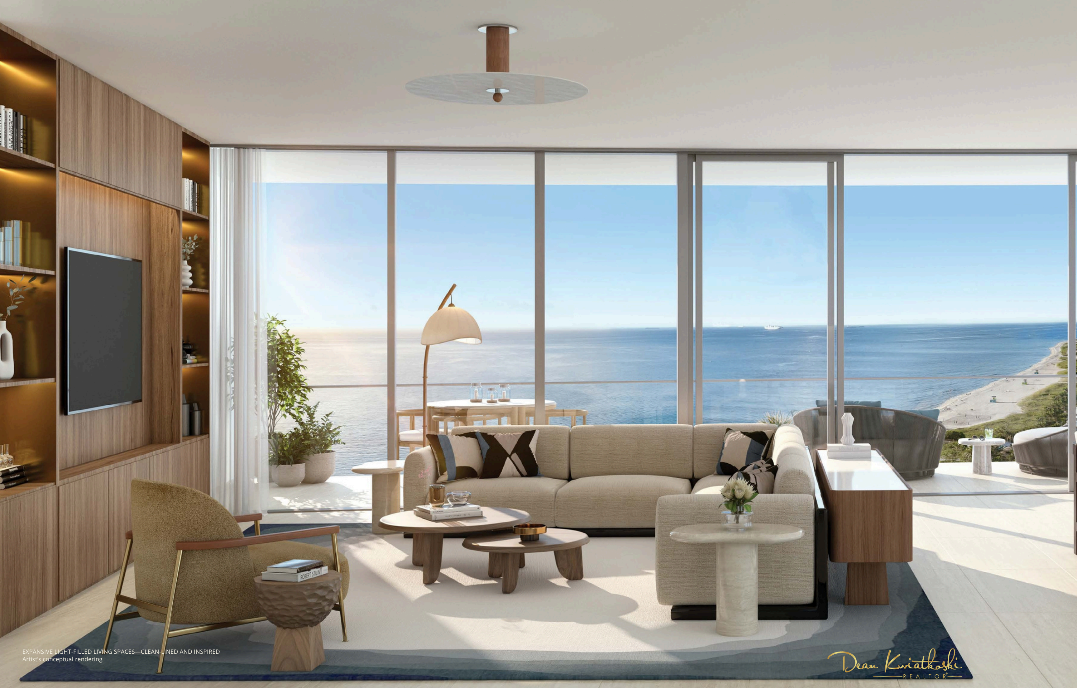
EXPANSIVE LIGHT-FILLED LIVING SPACES—CLEAN-LINED AND INSPIRED Artist's conceptual rendering