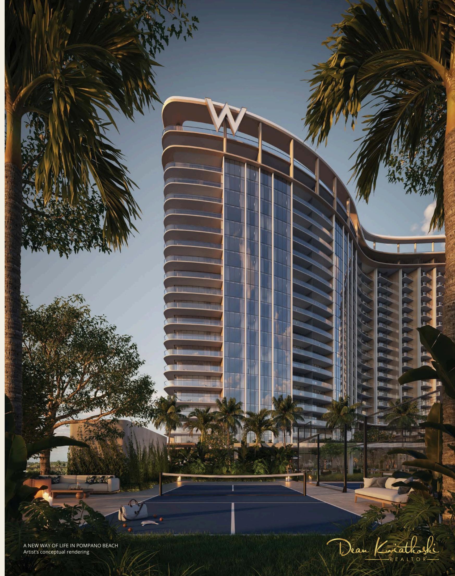
A NEW WAY OF LIFE IN POMpano BEACH Artist's conceptual rendering